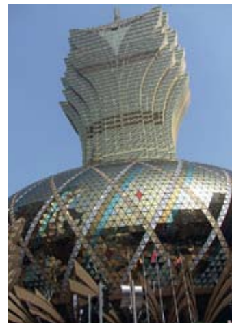
Modern architecture can be seen in Macao.