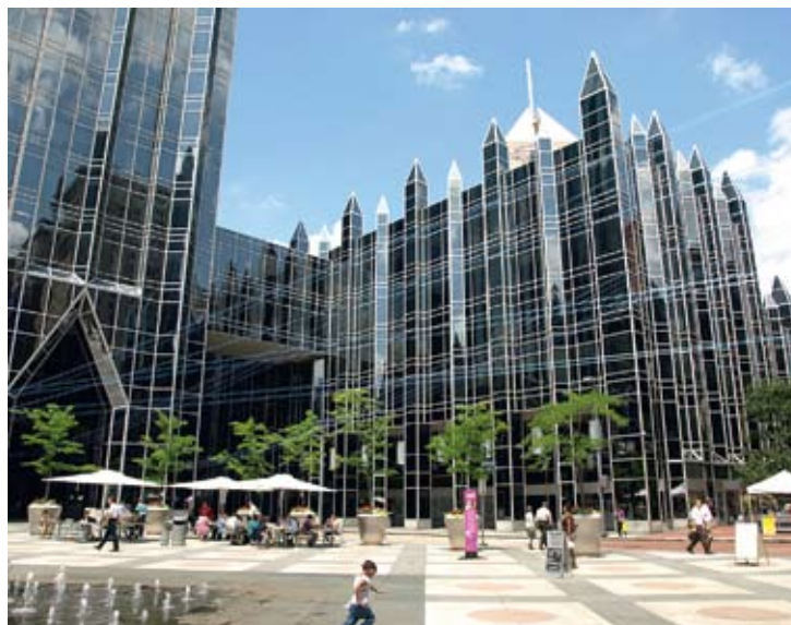
Pittsburgh offers a mixture of classic and modern architecture.

Emerging Technologies in Support of Smart Grids was the theme of another Super Session. It attempted to clarify the definition of a "Smart Grid" as the use of