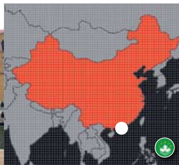
The Macau Special Administrative Region (MSAR) is a part of China's territory.

Kong and 145 km from the city of Guangzhou.