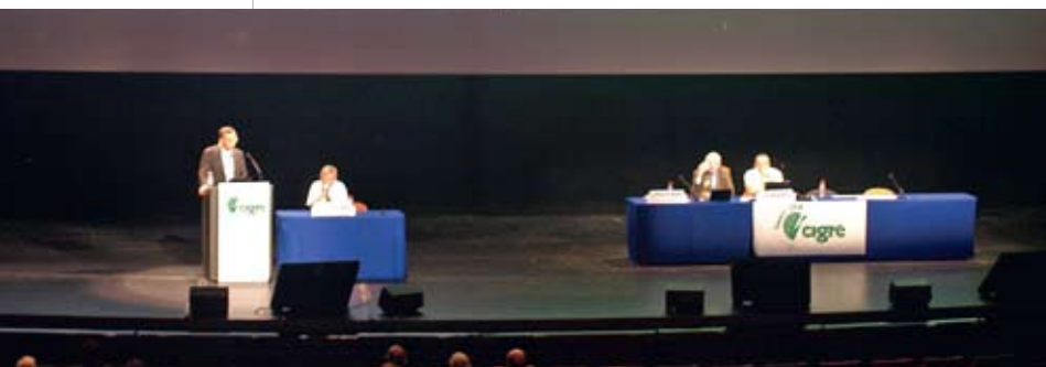
B5: Protection and Automation Paper Session.