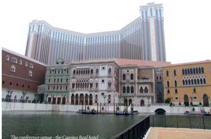
The conference venue - the Camino Real hotel