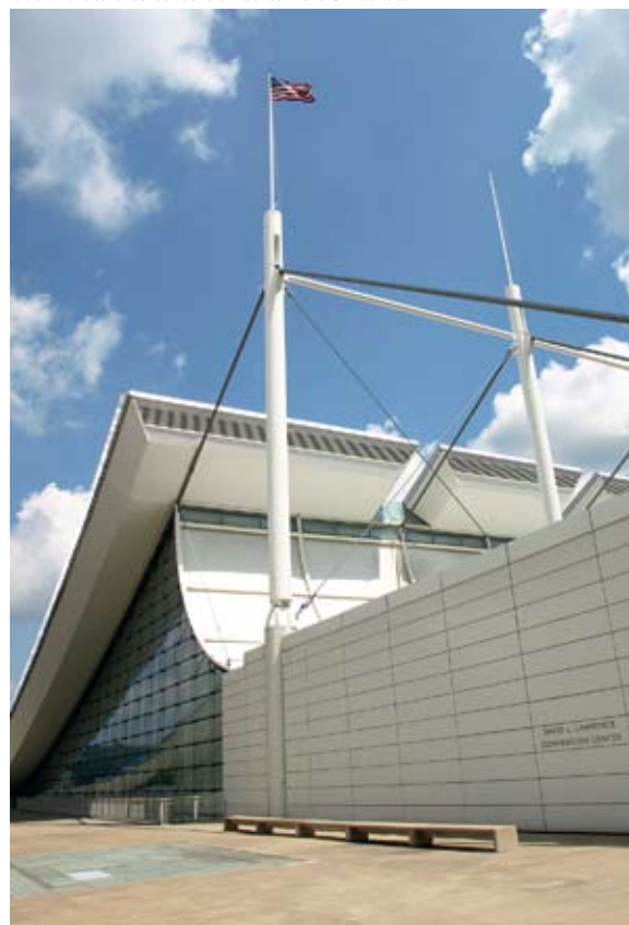
David L. Lawrence Convention Center - the GM venue.

a Student/ Faculty/Industry luncheon and Poster Contest.