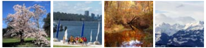
The seasons around the globe: spring / summer / autumn / winter

Tell us your opinion about the names of the PAC World issues during the year.