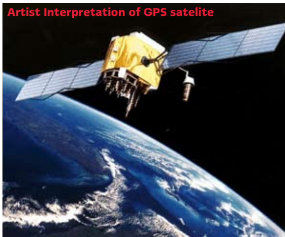
Artist Interpretation of GPS satellite