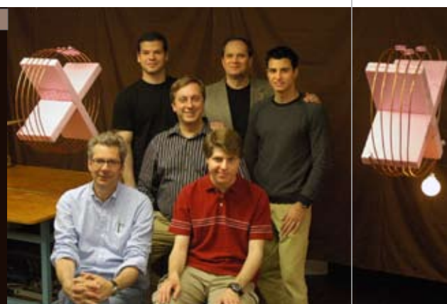
Wireless power transfer demonstration