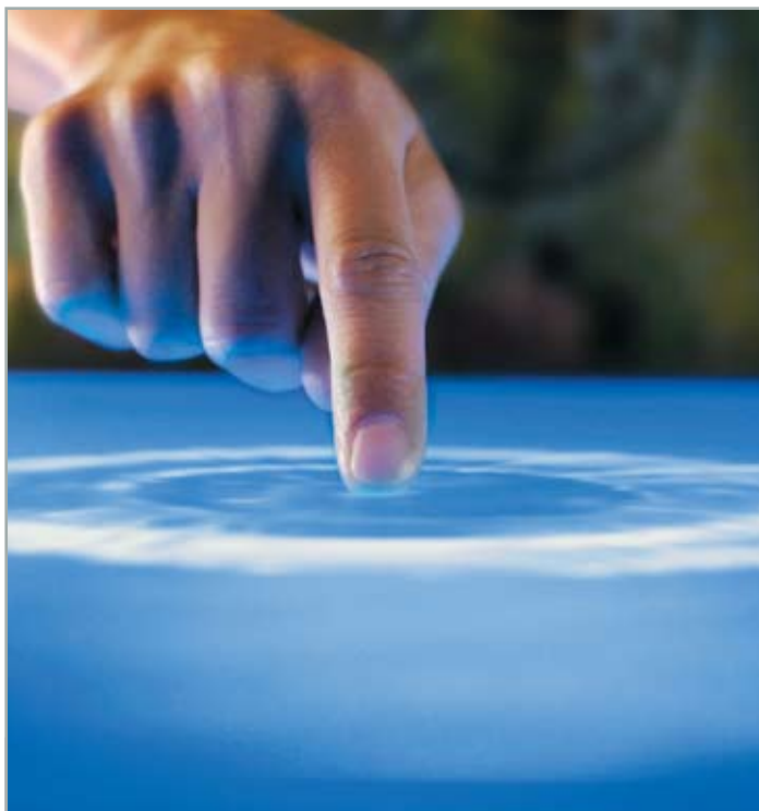
Surface computing recognizes points of contact.

■ Direct interaction. Users can actually "grab" digital information with their hands, interacting