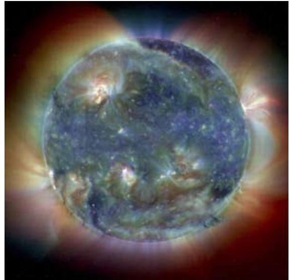
Composite Sun Flare Image: courtesy of NASA

The impact of solar activity on the power grid is not the only concern for protection specialists. The last few years have seen a significant increase in the interest and use of synchrophasors. The wide acceptance of IEC 61850 and the benefits of process bus will lead to the replacement of copper analog circuits with fiber cables transmitting sampled analog values. Both technologies require time synchronization