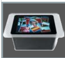
Microsoft Surface is designed as a 30-inch table like display.

To share your ideas about what we can do with Surface, please send an e-mail to: editor@pacw.org